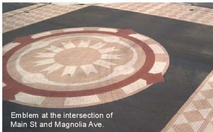
Emblem at the intersection of Main St and Magnolia Ave.

Traffic flow approaching the intersection on Main St will be allowed to make a right turn only at Magnolia Ave.